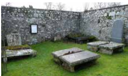
Clan MacGillivray enclosure showing new notice board.