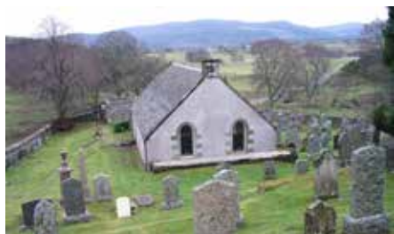
Dunlicity Church from the Hill.