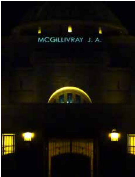
Australian War Memorial, Canberra.