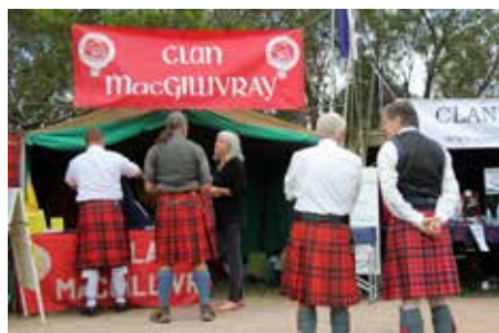
Clan MacGillivray Society Australia tent.