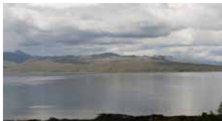
View from Teangue.