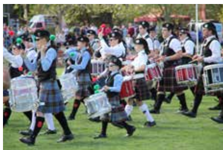
Mass band marching on the oval.