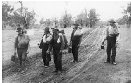
"Swaggies", this is the image of the Depression familiar to us today.