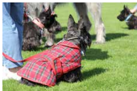
Terriers from the Scottish Terrier Club in "The March of the Scottish Clans and Societies".