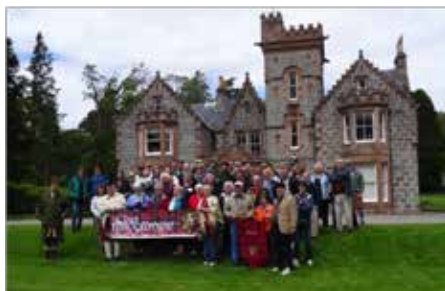
The happy crowd on the front lawn of the Dunmaglass Estate.

A picnic lunch took place in an exclusive location: the 14,000-acre Dunmaglass estate, held by the MacGillivrays as early as the 16th century. Back to the hotel, an important meeting was held among all the MacGillivray participants to debate the future of the Clan, as our last Chief died in 1942. In various periods, a renewed search for Chief's heirs was carried out, but with no success. After a brief but intense debate, the meeting unanimously agreed on two lines of action: i) promoting our mission with appropriate means and get the Clan's associations involved, with a view to finding suitable candidates for the position of Clan Commander and, in the spring of 2016, organising a Derbhfine for a five-year period election; ii) intensifying the search for the Chief's line descendants, to explore the possibility of establishing a new Chief line.